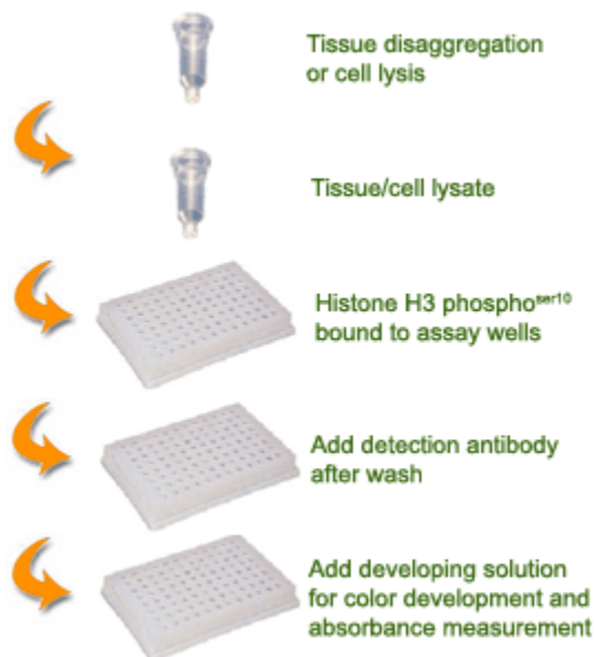
Schematic Procedure for Using the EpiQuik™ Global Histone H3 Phosphorylation (Ser10) Assay Kit (Colorimetric)

histone H3 (ser10) is proportional to the intensity of absorbance. The absolute amount of phospho histone H3 (ser10) can be quantitated by comparing to the standard control.