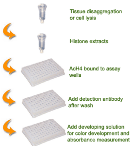
Schematic Procedure for Using the EpiQuik ™ Total Histone H4 Acetylation Detection Fast Kit (Colorimetric)

The EpiQuik ™ Total Histone H4 Acetylation Detection Fast Kit (Colorimetric) is designed for measuring total histone H4 acetylation in a fast format. In an assay with this kit, the acetyl histone H4 is captured to the strip wells which are coated with an anti-acetyl histone H4 antibody. The captured acetyl histone H4 can then be detected with a labeled detection antibody, followed by a color development reagent. The ratio of acetyl histone H4 is proportional to the intensity of absorbance. The absolute amount of acetyl histone H4 can be quantified by comparing to the standard control.