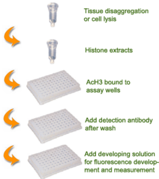
Schematic Procedure for Using the EpiQuik™ Total Histone H3 Acetylation Detection Fast Kit (Fluorometric)

H3 is captured to the strip wells coated with an anti-acetyl histone H3 antibody. The captured acetyl histone H3 can then be detected with a labeled detection antibody, followed by a fluorescent development reagent. The ratio of acetyl histone H3 is proportional to the intensity of fluorescence. The absolute amount of acetyl histone H3 can be quantified by comparing to the standard control.