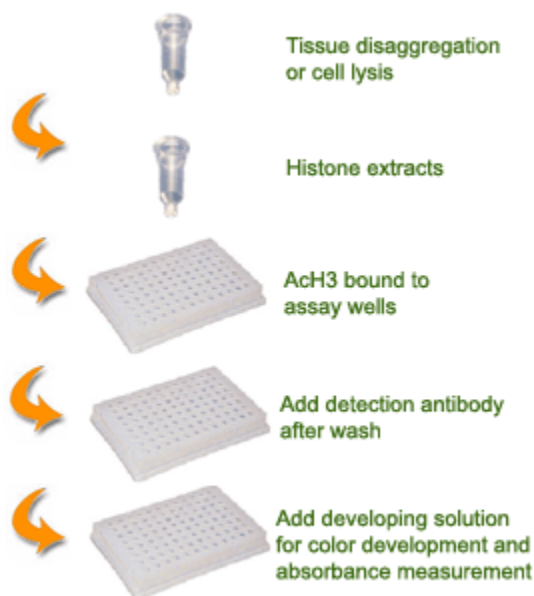
Schematic Procedure for Using the EpiQuik ™ Total Histone H3 Acetylation Detection Fast Kit (Colorimetric)