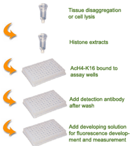
Schematic Procedure for the EpiQuik™ Global Acetyl Histone H4-K16 Quantification Kit (Fluorometric)

acetyl histone H4-K16 can then be detected with a labeled detection antibody, followed by a fluorescent development reagent. The ratio of acetyl H4-K16 is proportional to the intensity of fluorescence. The absolute amount of acetyl H4-K16 can be quantified by comparing to the standard control.