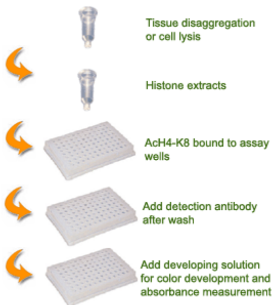
Schematic Procedure for Using the EpiQuik™ Global Acetyl Histone H4-K8 Quantification Kit (Colorimetric)