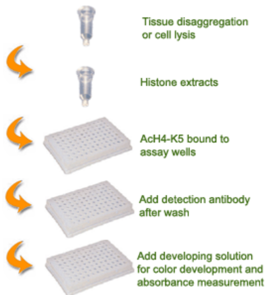
Schematic Procedure for Using the EpiQuik™ Global Acetyl Histone H4-K5 Quantification Kit (Colorimetric)