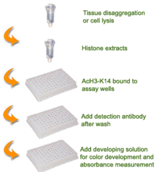
Schematic Procedure for Using the EpiQuik ™ Global Acetyl Histone H3-K14 Quantification Kit (Colorimetric)