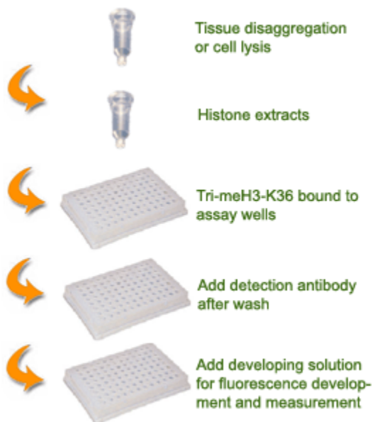
Schematic Procedure for Using the EpiQuik™ Global Tri-Methyl Histone H3-K36 Quantification Kit (Fluorometric)