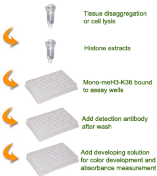
Schematic Procedure for Using the EpiQuik™ Global Mono-Methyl Histone H3-K36 Quantification Kit (Colorimetric)