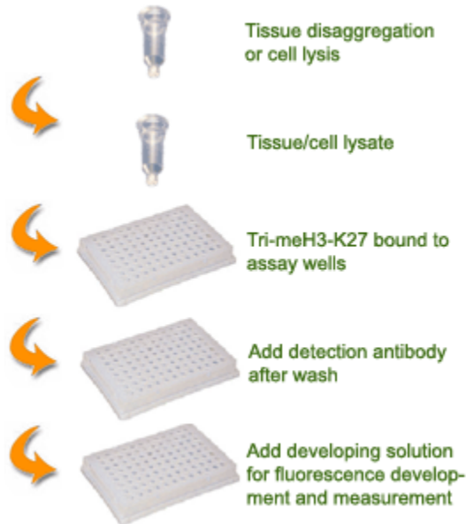
Schematic Procedure for Using the EpiQuik™ Global Tri-Methyl Histone H3-K27 Quantification Kit (Fluorometric)

histone H3 at lysine 27 is captured to the strip wells coated with an anti-trimethyl H3-K27 antibody. The captured tri-methylated histone H3-K27 can then be detected with a labeled detection antibody, followed by a fluorescent development reagent. The ratio of tri-methylated H3-K27 is proportional to the intensity of fluorescence. The absolute amount of tri-methylated H3-K27 can be quantitated by comparing to the standard control.