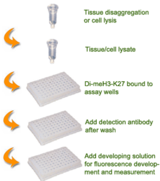
Schematic Procedure for Using the EpiQuik™ Global Di-Methyl Histone H3-K27 Quantification Kit (Fluorometric)

antibody followed by fluorescent development reagent. The ratio of di-methylated H3-K27 is proportional to the intensity of fluorescence. The absolute amount of di-methylated H3-K27 can be quantitated by comparing to the standard control.