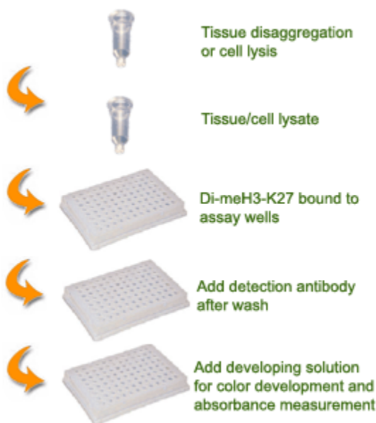
Schematic Procedure for Using the EpiQuik™ Global Di-Methyl Histone H3-K27 Quantification Kit (Colorimetric)

is proportional to the intensity of absorbance. The absolute amount of di-methylated H3-K27 can be quantitated by comparing to the standard control