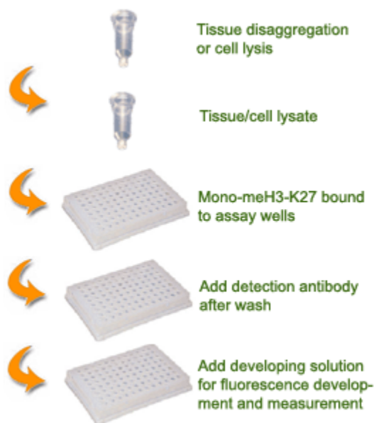
Schematic Procedure for Using the EpiQuik ™ Global Mono-Methyl Histone H3-K27 Quantification Kit (Fluorometric)

The EpiQuik ™ Global Mono-Methyl Histone H3-K27 Quantification Kit (Fluorometric) is designed for measuring global histone H3-K27 mono-methylation. In an assay with this kit, the mono-methylated histone H3 at lysine 27 is captured to the strip wells coated with an anti-mono-methyl H3-K27 antibody. The captured mono-methylated histone H3-K27 can then be detected with a labeled detection antibody, followed by a fluorescent development reagent. The ratio of mono-methylated H3-K27 is proportional to the intensity of fluorescence. The absolute amount of mono-methylated H3-K27 can be quantitated by comparing to the standard control.