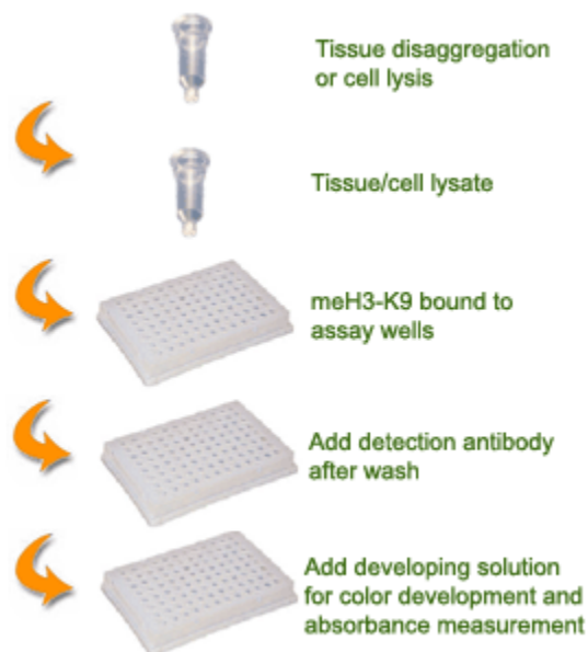
Schematic Procedure for Using the EpiQuik™ Global Pan-Methyl Histone H3-K9 Quantification Kit (Colorimetric)

development reagent. The ratio of mono-, di-, and tri-methylated H3-K9 is proportional to the intensity of absorbance. The absolute amount of the methylated H3-K9 can be quantitated by comparing to the standard control.