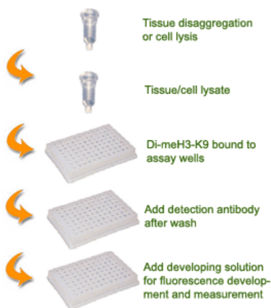
Schematic Procedure for Using the EpiQuik ™ Global Di-Methyl Histone H3-K9 Quantification Kit (Fluorometric)

The EpiQuik ™ Global Di-Methyl Histone H3-K9 Quantification Kit (Fluorometric) is designed for measuring global histone H3-K9 di-methylation. In an assay with this kit, the di-methylated histone H3 at lysine 9 is captured to the strip wells coated with an anti-di-methyl H3-K9 antibody. The captured di-methylated histone H3-K9 can then be detected with a labeled detection antibody, followed by a fluorescent development reagent. The ratio of di-methylated H3-K9 is proportional to the intensity of fluorescence. The absolute amount of di-methylated H3-K9 can be quantitated by comparing to the standard control.