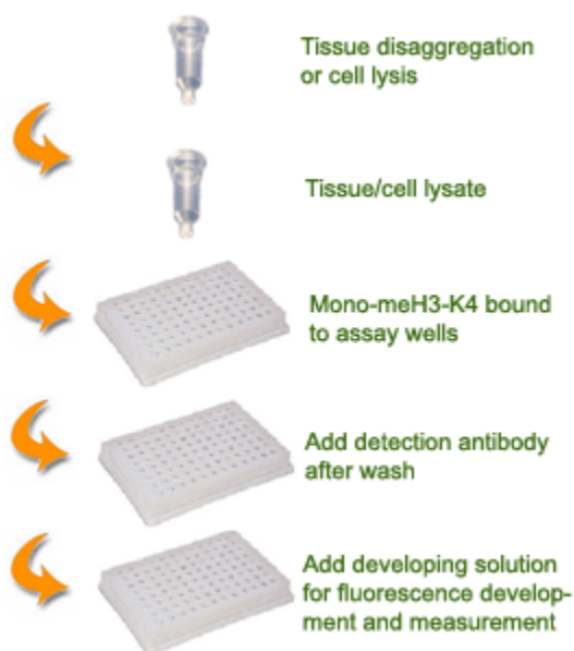
Schematic Procedure for Using the EpiQuik™ Global MonoMethyl Histone H3-K4 Quantification Kit (Fluorometric)

labeled detection antibody followed by a fluorescent development reagent. The ratio of mono-methylated H3-K4 is proportional to the intensity of fluorescence. The absolute amount of mono-methylated H3-K4 can be quantitated by comparing to the standard control.