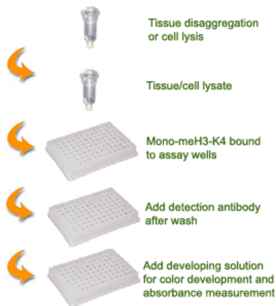
Schematic Procedure for Using the EpiQuik™ Global Mono-Methyl Histone H3-K4 Quantification Kit (Colorimetric)