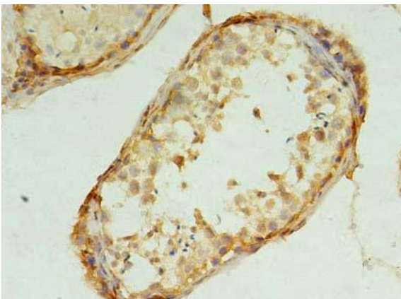
Immunohistochemistry of paraffin-embedded human testis tissue at dilution of 1:100

ELISA, IHC; Recommended dilution: IHC:1:20-1:200