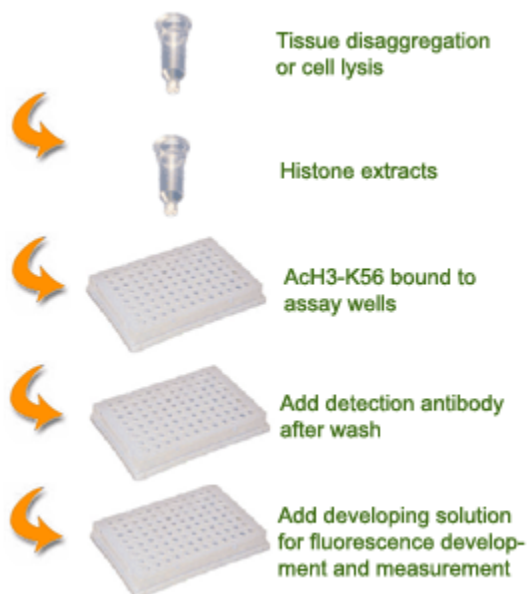
Schematic Procedure for Using the EpiQuik™ Global Acetyl Histone H3-K56 Quantification Kit (Fluorometric)