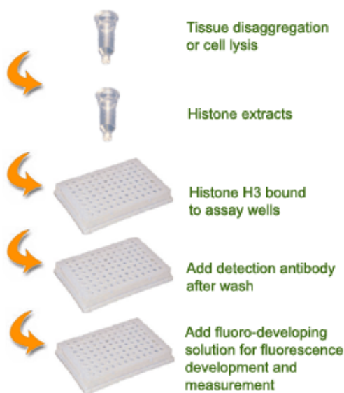
Schematic Procedure for Using the EpiQuik ™ Total Histone H3 Quantification Kit (Fluorometric)

The EpiQuik ™ Total Histone H3 Quantification Kit (Fluorometric) is designed for quantifying the level of histone H3 protein independent of its modified state. In an assay with this kit, the histone H3 protein is spotted on the strip wells. The spotted histone H3 can then be detected with a detection antibody, followed by a fluorescent development reagent. The ratio of histone H3 is proportional to the intensity of fluorescence. The absolute amount of histone H3 can be quantified by comparing to the standard control.