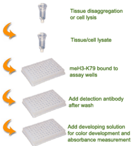
Schematic Procedure for Using the EpiQuik™ Global Pan-Methyl Histone H3-K79 Quantification Kit (Colorimetric)

this kit, the methylated histone H3 at lysine 79 is captured to the strip wells coated with antibodies specifically for mono-, di-, and tri-methyl H3-K79. The captured mono-, di-, and tri-methylated histone H3-K79 can then be detected with a labeled detection antibody, followed by a color development reagent. The ratio of mono-, di-, and tri-methylated H3-K79 is proportional to the intensity of absorbance. The absolute amount of the methylated H3-K79 can be quantitated by comparing to the standard control.