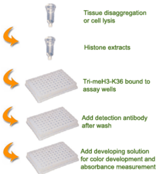
Schematic Procedure for Using the EpiQuik™ Global Tri-Methyl Histone H3-K36 Quantification Kit (Colorimetric)