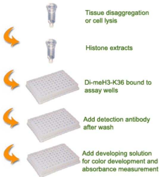
Schematic Procedure for Using the EpiQuik™ Global Di-Methyl Histone H3-K36 Quantification Kit (Colorimetric)