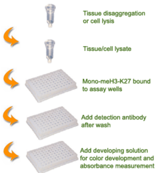
Schematic Procedure for Using the EpiQuik™ Global Mono-Methyl Histone H3-K27 Quantification Kit (Colorimetric)

methylated H3-K27 is proportional to the intensity of absorbance. The absolute amount of mono-methylated H3-K27 can be quantitated by comparing to the standard control.