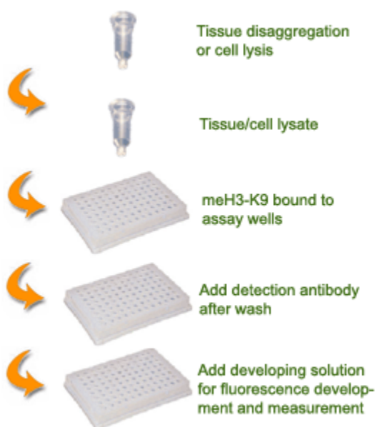
Schematic Procedure for Using the EpiQuik ™ Global Pan-Methyl Histone H3-K9 Quantification Kit (Fluorometric)

The EpiQuik ™ Global Pan-Methyl Histone H3-K9 Quantification Kit (Fluorometric) is designed for simultaneously measuring global histone H3-K9 mono-, di-, and tri-methylation. In an assay with this kit, the methylated histone H3 at lysine 9 is captured to the strip wells coated with antibodies specifically for mono-, di-, and tri-methyl H3-K9. The captured mono-, di-, and tri-methylated histone H3-K9 can then be detected with a labeled detection antibody, followed by a fluorescent development reagent. The ratio of mono-, di-, and tri-methylated H3-K9 is proportional to the intensity of fluorescence. The absolute amount of the methylated H3-K9 can be quantitated by comparing to the standard control.