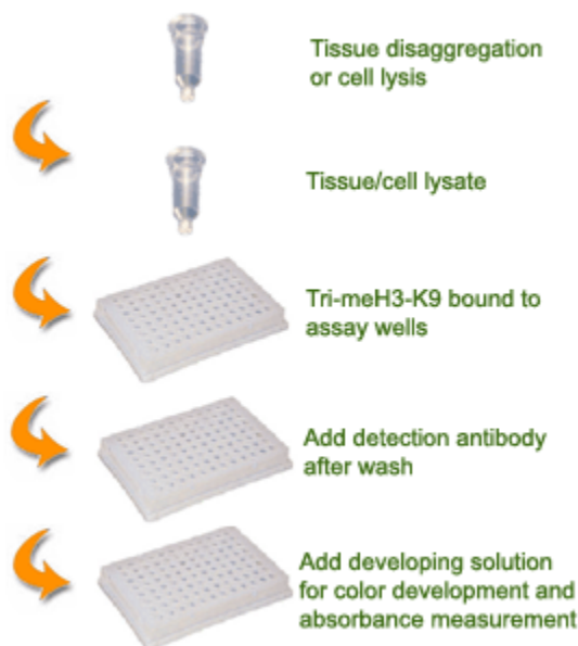
Schematic Procedure for Using the EpiQuik™ Global Tri-Methyl Histone H3-K9 Quantification Kit (Colorimetric)

followed by a color development reagent. The ratio of tri-methylated H3-K9 is proportional to the intensity of absorbance. The absolute amount of tri-methylated H3-K9 can be quantitated by comparing to the standard control.