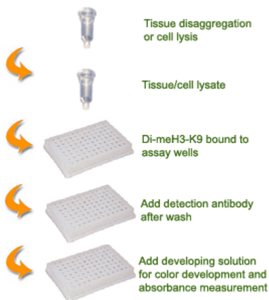
Schematic Procedure for Using the EpiQuik ™ Global Di-Methyl Histone H3-K9 Quantification Kit (Colorimetric)

The EpiQuik ™ Global Di-Methyl Histone H3-K9 Quantification Kit (Colorimetric) is designed for measuring global histone H3-K9 di-methylation. In an assay with this kit, the di-methylated histone H3 at lysine 9 is captured to the strip wells coated with an anti-dimethyl H3-K9 antibody. The captured di-methylated histone H3-K9 can then be detected with a labeled detection antibody, followed by a color development reagent. The ratio of di-methylated H3-K9 is proportional to the intensity of absorbance. The absolute amount of di-methylated H3-K9 can be quantitated by comparing to the standard control.