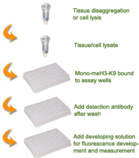
Schematic Procedure for Using the EpiQuik™ Global Mono-Methyl Histone H3-K9 Quantification Kit (Fluorometric)

labeled detection antibody, followed by a fluorescent development reagent. The ratio of mono-methylated H3-K9 is proportional to the intensity of fluorescence. The absolute amount of mono-methylated H3-K9 can be quantitated by comparing to the standard control.