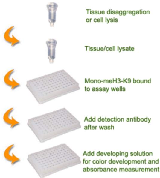
Schematic Procedure for Using the EpiQuik™ Global Mono-Methyl Histone H3-K9 Quantification Kit (Colorimetric)