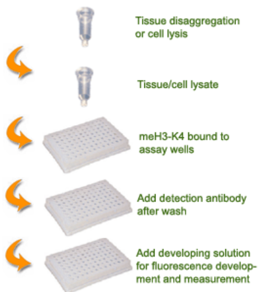
Schematic Procedure for Using the EpiQuik ™ Global Pan-Methyl Histone H3-K4 Quantification Kit (Fluorometric)

The EpiQuik ™ Global Pan-Methyl Histone H3-K4 Quantification Kit (Fluorometric) is designed for simultaneously measuring global histone H3-K4 mono-, di-, and tri-methylation. In an assay with this kit, the methylated histone H3 at lysine 4 is captured to the strip wells coated with antibodies specifically for mono-, di-, and tri-methyl H3-K4. The captured mono-, di-, and tri-methylated histone H3-K4 can then be detected with a labeled detection antibody, followed by a fluorescent development reagent. The ratio of mono-, di-, and tri-methylated H3-K4 is proportional to the intensity of fluorescence. The absolute amount of the methylated H3-K4 can be quantitated by comparing to the standard control.