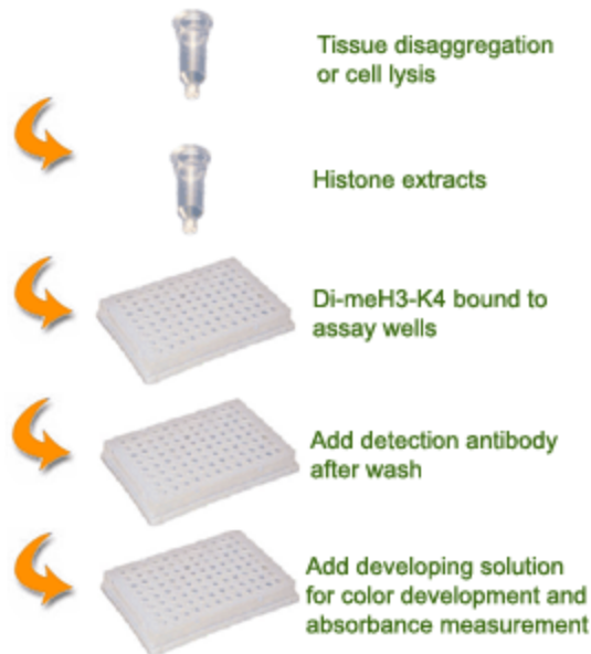
Schematic Procedure for Using the EpiQuik™ Global Di-Methyl Histone H3-K4 Quantification Kit (Colorimetric)

intensity of absorbance. The absolute amount of di-methylated H3-K4 can be quantified by comparing to the standard control.